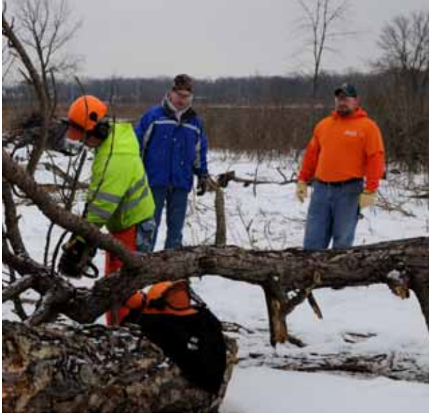
FPDCC/IDNR Staff, Photo by Dave Waycie

On February 20th, crews shifted their focus from the prairie to the Hickory Lane buffer area tackling stands of brush and non-native trees still standing after the January workdays. Invasive woody species deprive native wetland and prairie plants of water and light needed for survival and alter the natural hydrological dynamic required for healthy native ecosystems. Restoration restores balance and biodiversity to natural areas.