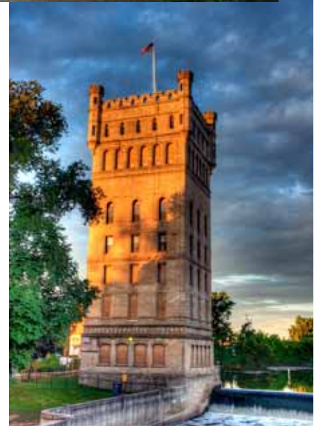
Hofmann Tower in Lyons