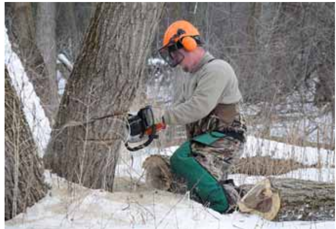
FPDCC/IDNR Staff