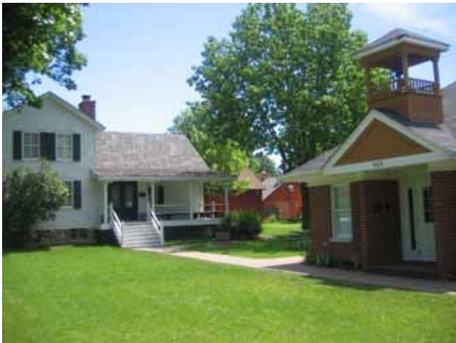
Schuett-Biermann Farmhouse and Schoolhouse