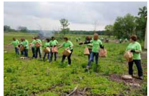
Exelon Employees Seeding the Prairie