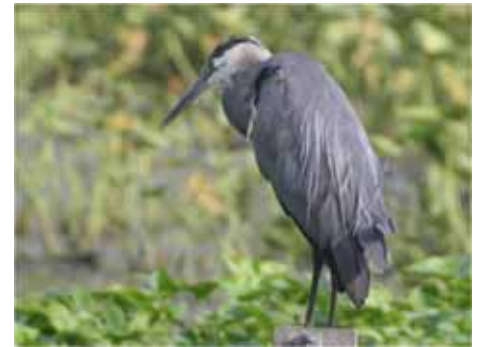
Heron