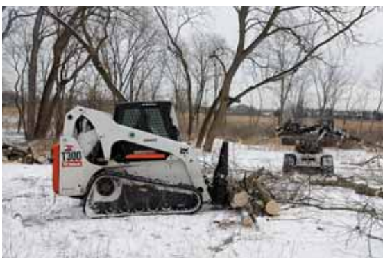
Bobcat Stacking Brush

Braving some of the coldest temperatures of the season, members of the IDNR and INPC SWAT team and the Natural Resource Management team with the FPDCC conducted the first scheduled management activity of the year at Wolf Road Prairie on January 4th and January 5th. During this two-day effort, the teams gathered at the #9 and #11 Hickory Lane buffer areas at the edge of the Wolf Road Prairie wetland to begin the rigorous task of clearing a section of bufferland of invasive brush and non-native trees. Two bobcats on track mounted vehicles were provided by the FPDCC. They exert very low psi (pounds per square inch) on the ground and minimize impact to the soil. A grappler head provided by IDNR was attached to a bobcat. These machines are designed to pick up and move massive amounts of cut brush.