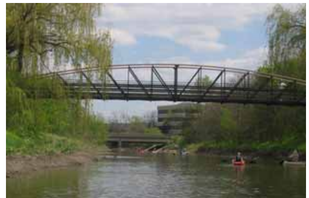
Canoeing on Salt Creek