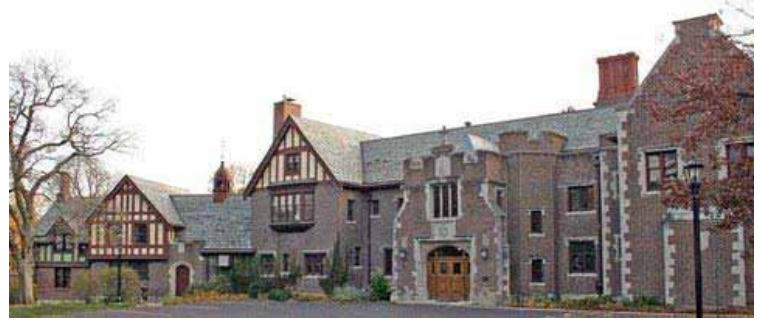
Mayslake Hall, Peabody Estate, Photo by Forest Preserve District of DuPage County