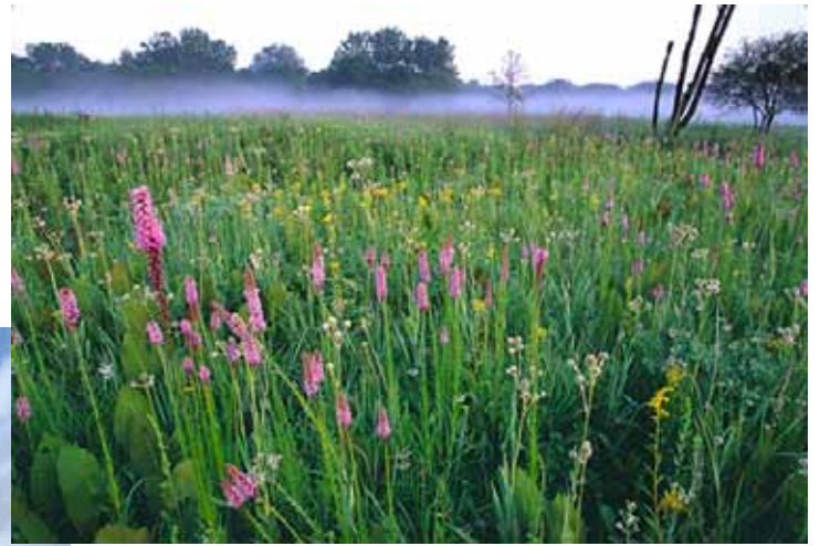
Wolf Road Prairie, Photo by Dan Kirk, Illinois Department of Natural Resources