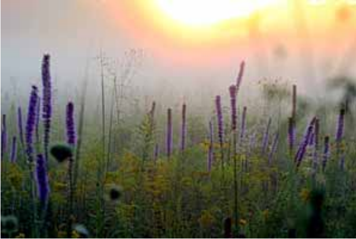
Sunrise over Wolf Road Prairie

The Salt Creek Greenway Association (SCGA) has identified the 80 acre Wolf Road Prairie Nature Preserve and 43 acre Hickory Lane bufferlands restoration as a priority project in the Greenway.