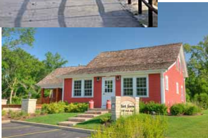
The York Tavern