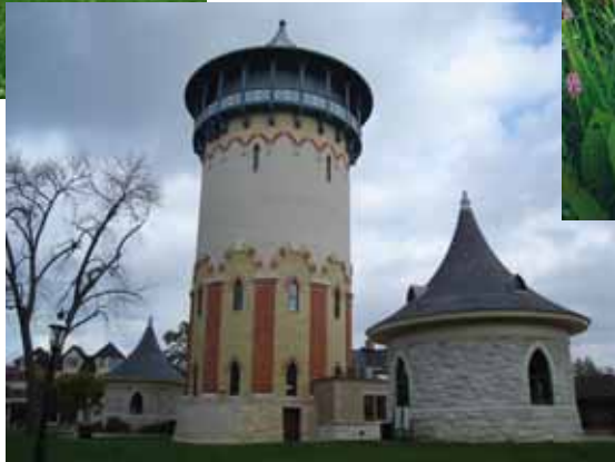
Riverside Tower and Well House