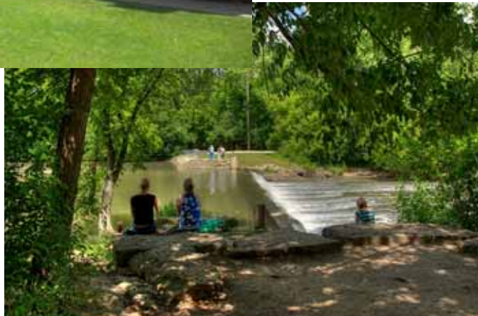
Salt Creek