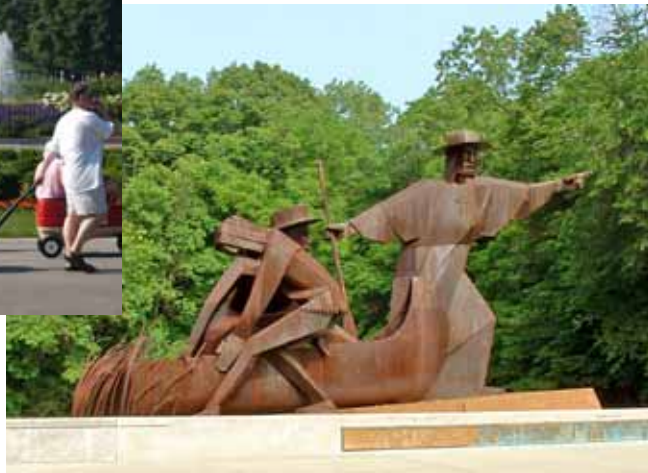
Historic Chicago Portage Site