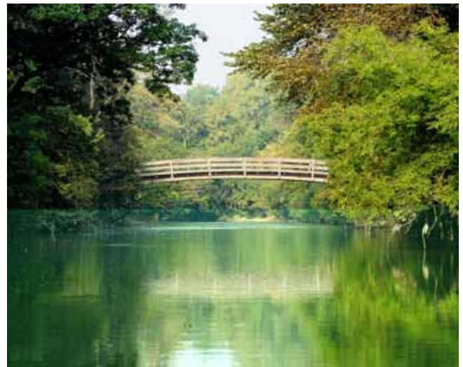
Bridge over Salt Creek

But the flooding and damage could have been much worse had not the Forest Preserve Districts of Cook and DuPage Counties acquired flood prone lands and open space within the watershed.