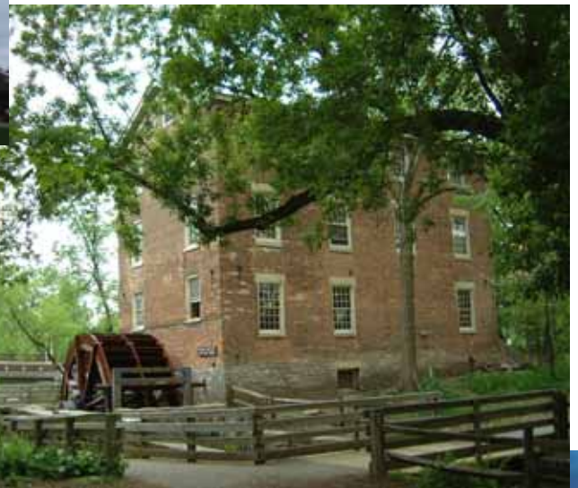
Graue Mill and Dam