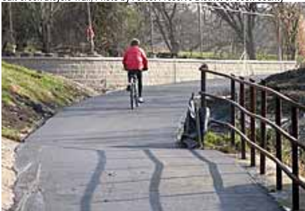
Salt Creek Bicycle Trail