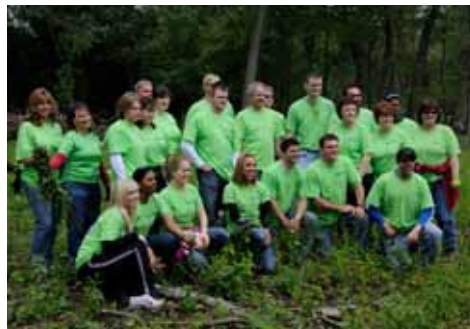
Exelon Group Photo