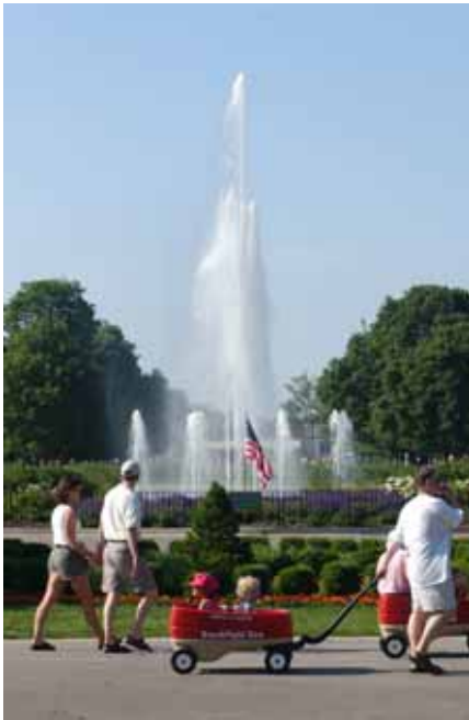
Roosevelt Fountain at Brookfield Zoo, Photo by Jim Schultz, Chicago Zoological Society