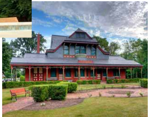
Grossdale Station in Brookfield